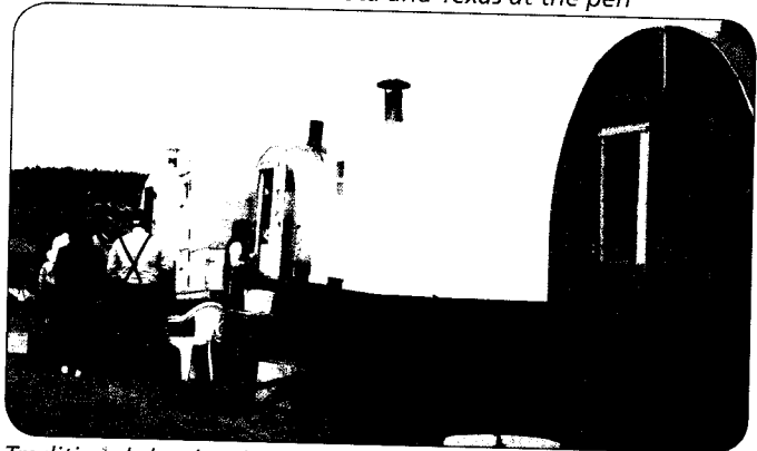
Traditional shepherds' wagons